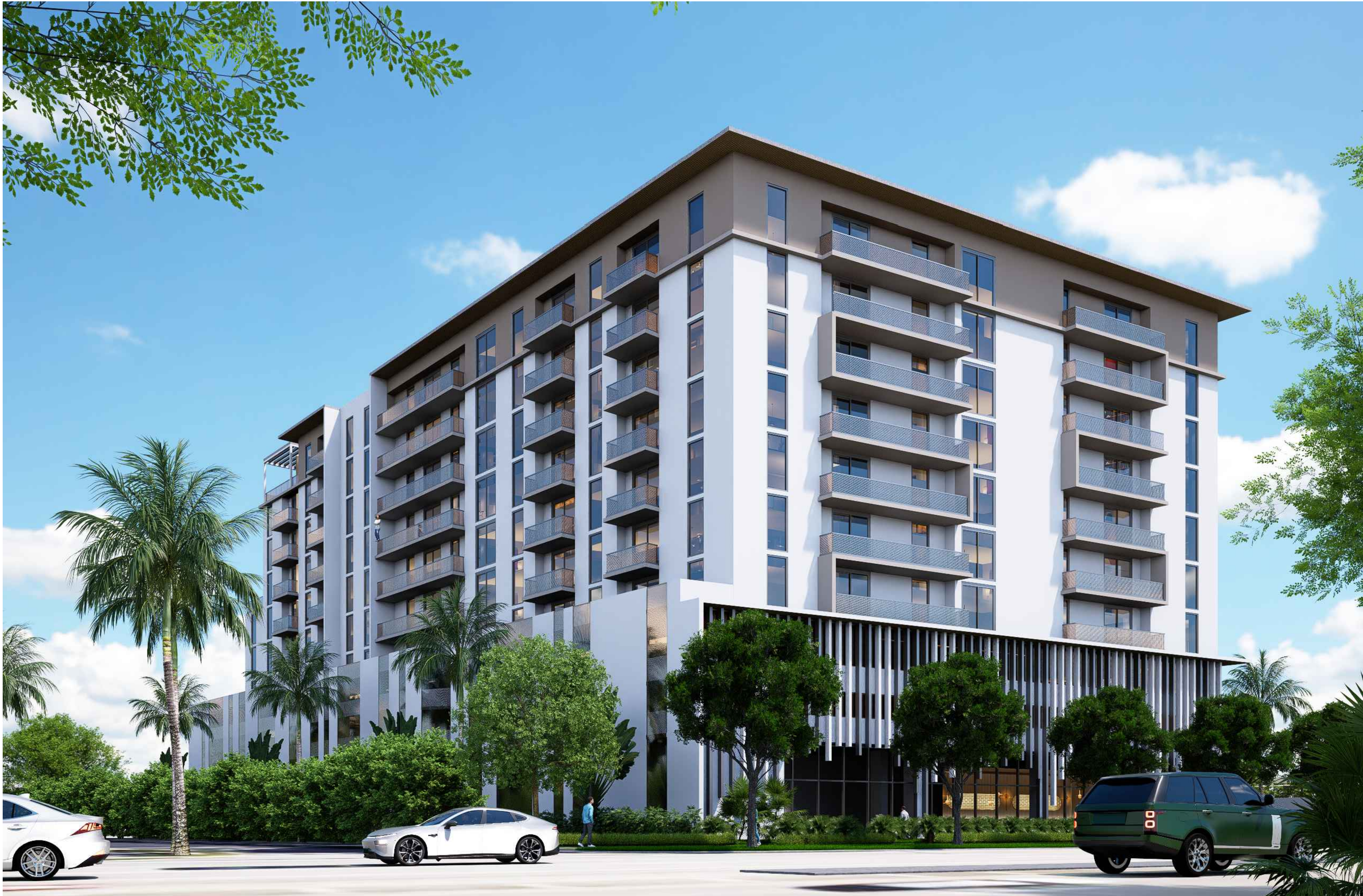
STREET VIEW OF THE SOUTH WEST CORNER OF THE BUILDING